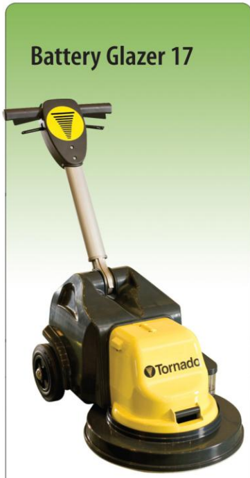
Battery Glazer 17